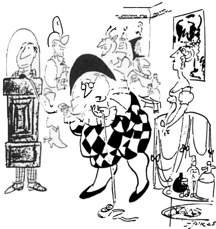
"My God! I'm ruined!"